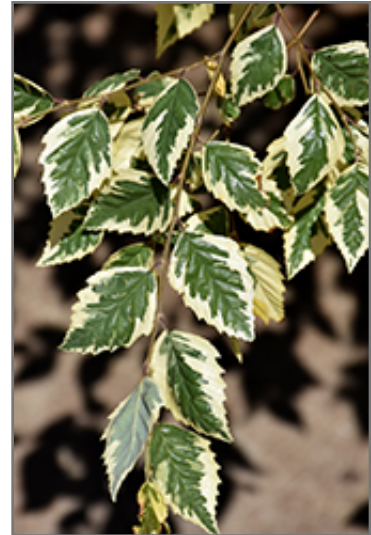
Shiloh Splash River Birch foliage

Shiloh Splash River Birch will grow to be about 30 feet tall at maturity, with a spread of 15 feet. It has a low canopy with a typical clearance of 3 feet from the ground, and should not be planted underneath power lines. It grows at a medium rate, and under ideal conditions can be expected to live for 70 years or more.