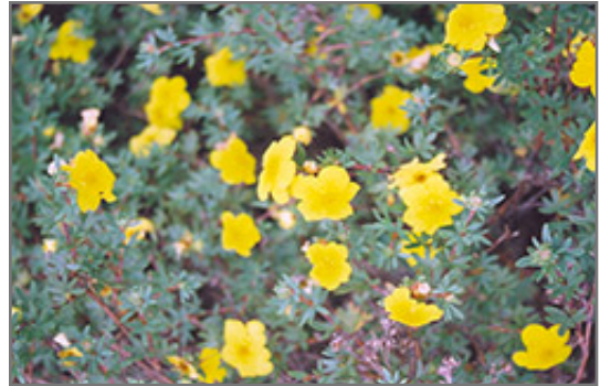
Yellow Gem Potentilla flowers