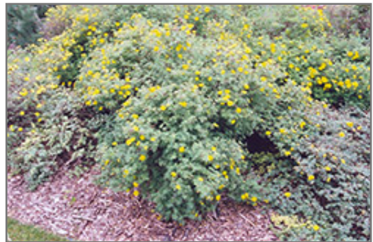
Yellow Gem Potentilla in bloom