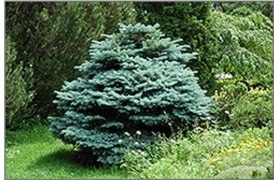
Globe Blue Spruce

Globe Blue Spruce will grow to be about 8 feet tall at maturity, with a spread of 6 feet. It tends to fill out right to the ground and therefore doesn't necessarily require facer plants in front, and is suitable for planting under power lines. It grows at a slow rate, and under ideal conditions can be expected to live for 60 years or more.