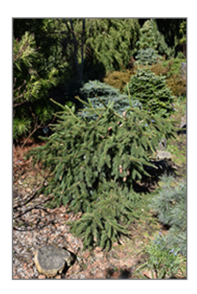
Red Cone Spruce