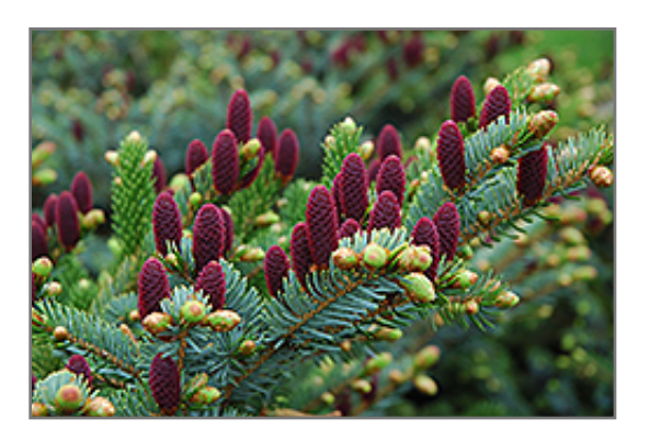
Red Cone Spruce fruit