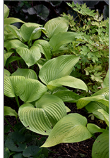
Key West Hosta

This plant does best in partial shade to shade. It prefers to grow in average to moist conditions, and shouldn't be allowed to dry out. It is not particular as to soil type or pH. It is somewhat tolerant of urban pollution. This particular variety is an interspecific hybrid. It can be propagated by division; however, as a cultivated variety, be aware that it may be subject to certain restrictions or prohibitions on propagation.