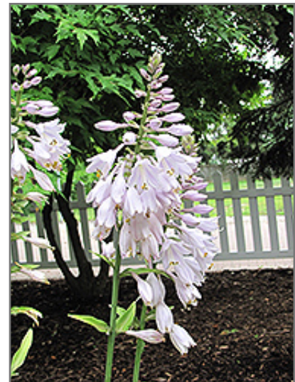
Key West Hosta flowers