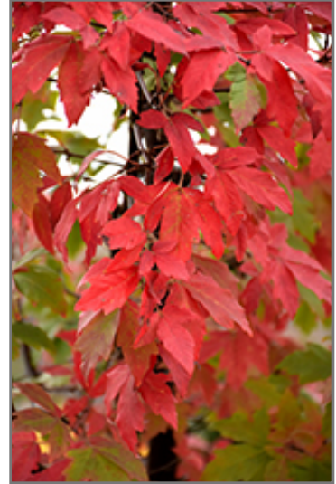
Paperbark Maple in fall

This tree does best in full sun to partial shade. It prefers to grow in average to moist conditions, and shouldn't be allowed to dry out. It is not particular as to soil type or pH. It is somewhat tolerant of urban pollution. This species is not originally from North America.