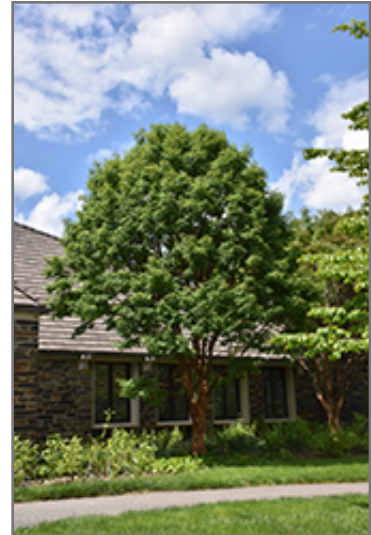
Paperbark Maple